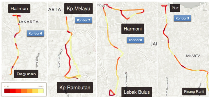
Image 2. Mapping TransJakarta bus routes speed in problematic locations to improve services.

To determine which stations have the longest waiting times, the project used tap-in data and fleet GPS data based on number of buses (GPS) and number of passengers (tap-in). The methods and findings from the project were shared with TransJakarta to help improve route planning and regularity of service and inform plans to expand station facilities. The project highlighted key questions that TransJakarta could further research, such as exploring why some passengers only travel one-way instead of a round trip.